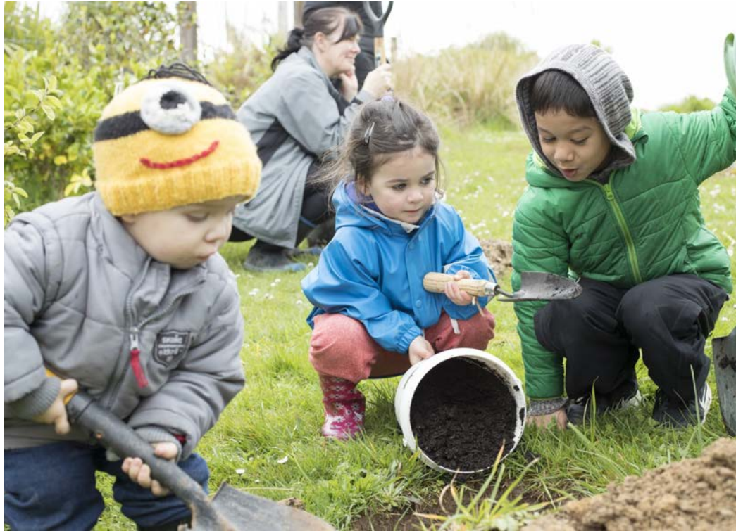
All Rights Reserved. Ministry of Education | Te Tāhuhu o Te Mātauranga