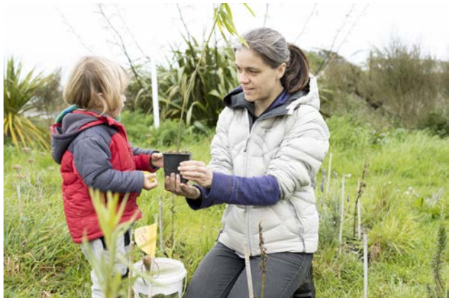
Can I trust you? Wellbeing/Mana atua