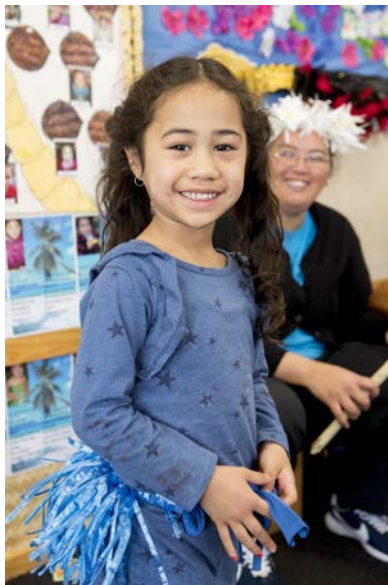
Do you know me? Belonging/Mana whenua