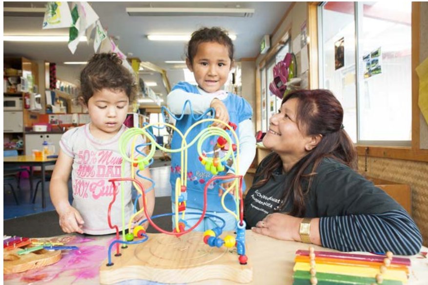
All Rights Reserved. Ministry of Education | Te Tāhuhu o Te Mātauranga

Diversity: the fact of many different types of things or people being included in something; a range of different things or people.