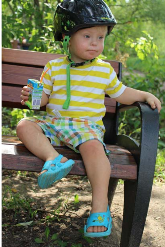
Kids

“... every child will experience an empowering curriculum that recognises and enhances their mana and supports them to enhance the mana of others”