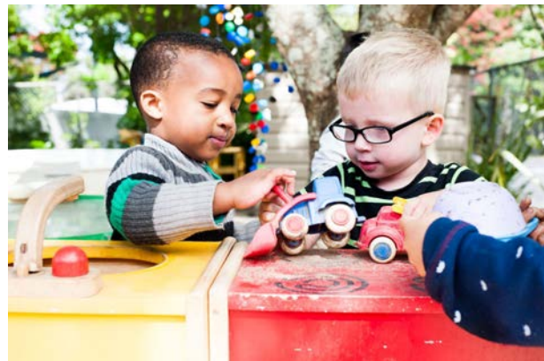
Is this place fair? Contribution/Mana tangata

All Rights Reserved. Ministry of Education | Te Tāhuhu o Te Mātauranga